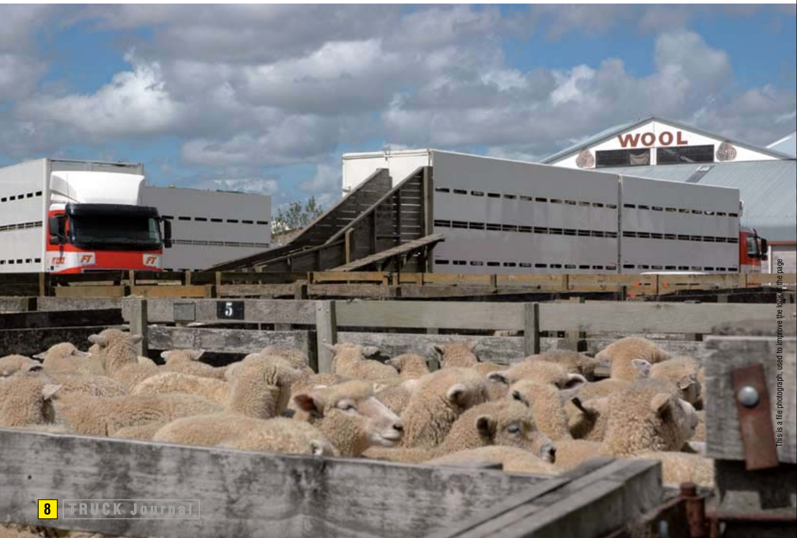
This is a file photograph, used to improve the look of the page